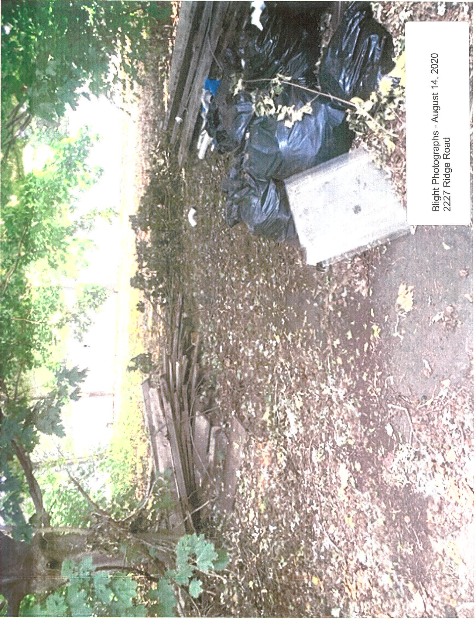
Blight Photographs - August 14, 2020 2227 Ridge Road