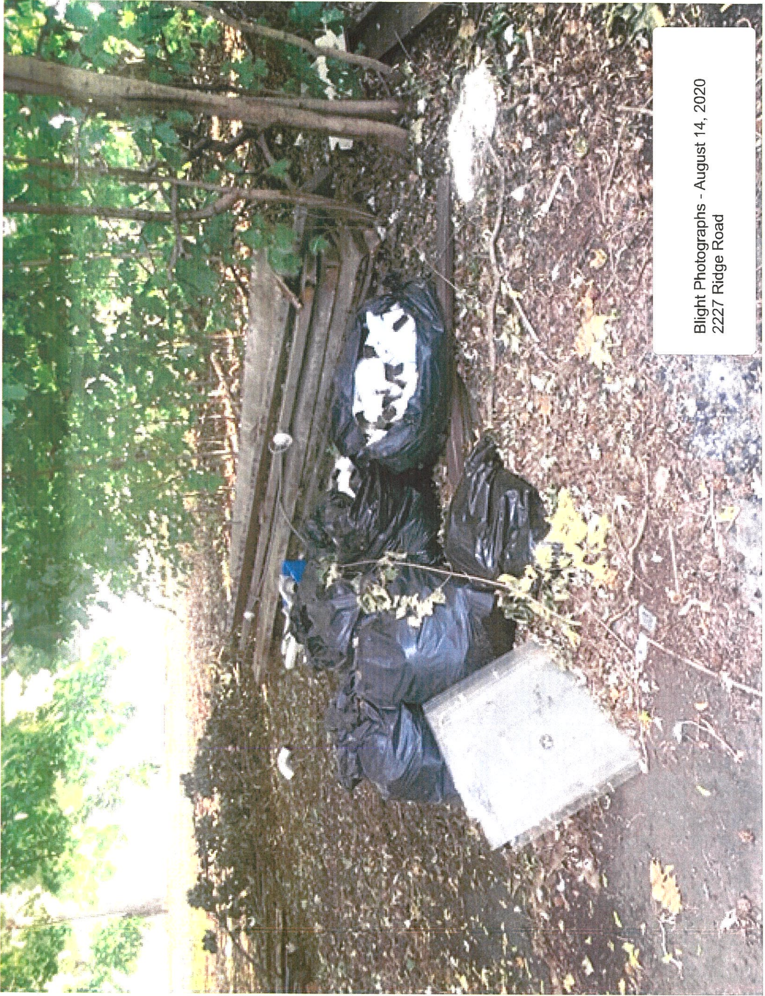
Blight Photographs - August 14, 2020 2227 Ridge Road