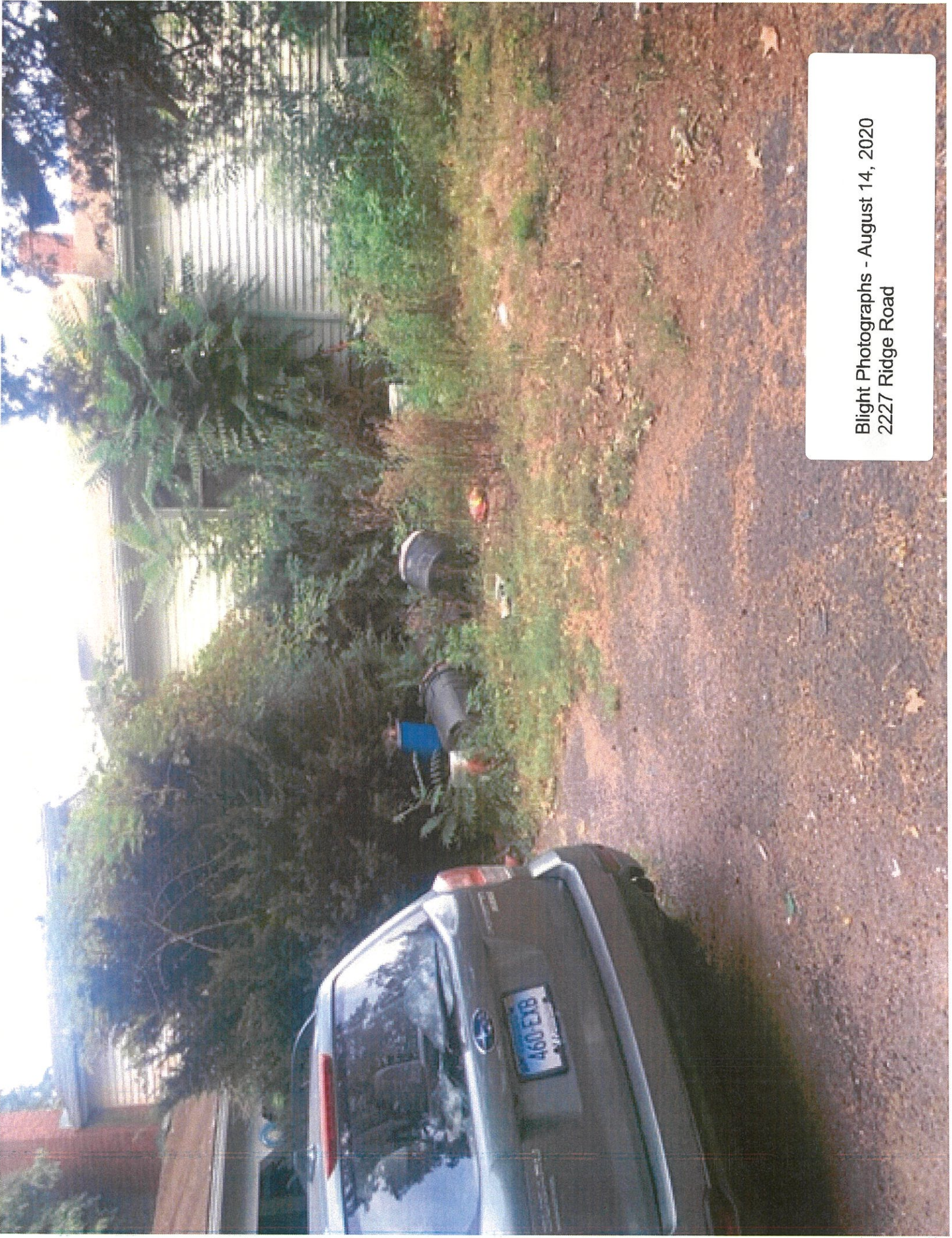
Blight Photographs - August 14, 2020 2227 Ridge Road