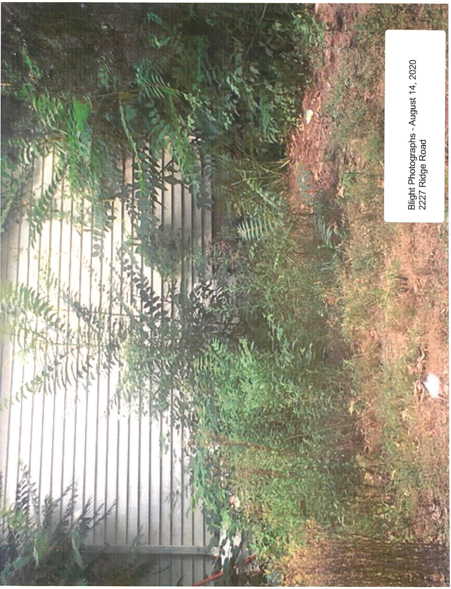
Blight Photographs - August 14, 2020 2227 Ridge Road