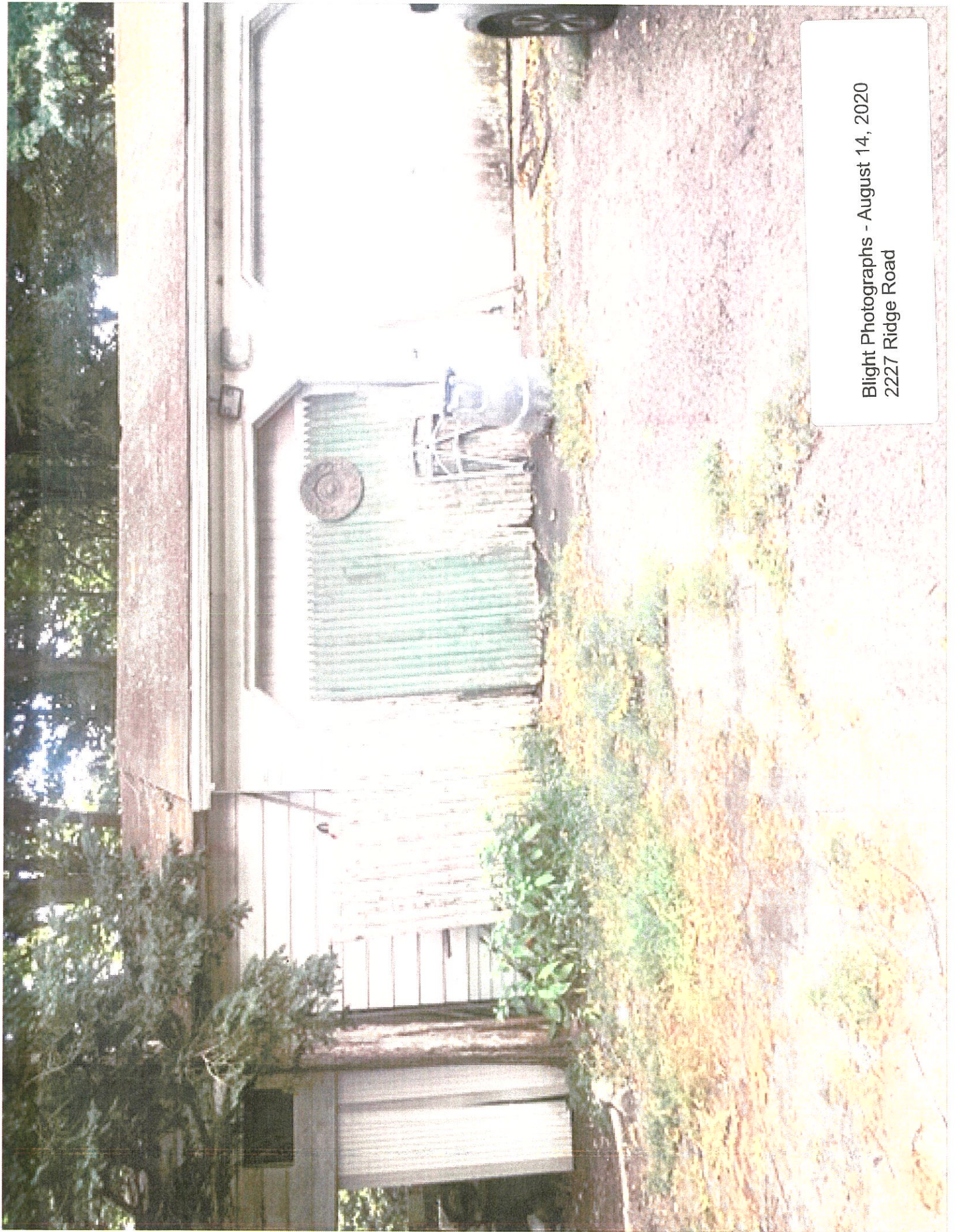
Blight Photographs - August 14, 2020 2227 Ridge Road